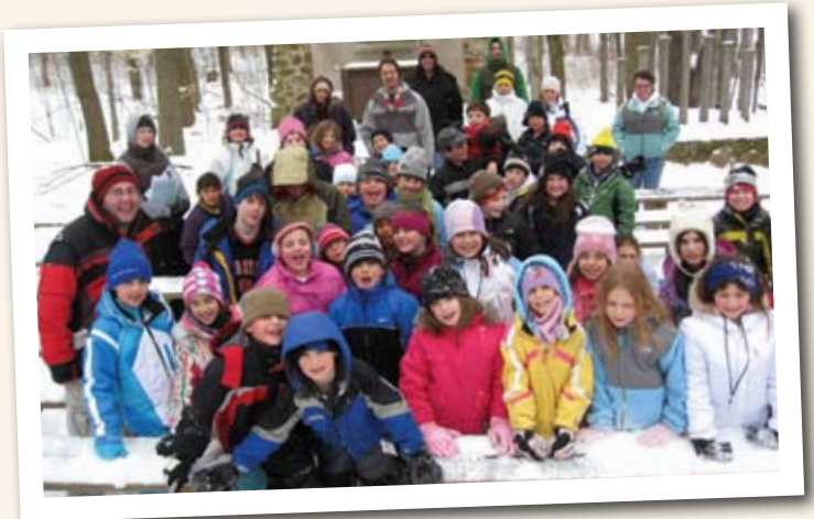
The Temple-Tifereth Israel's 3rd grade had a great time on their winter retreat!